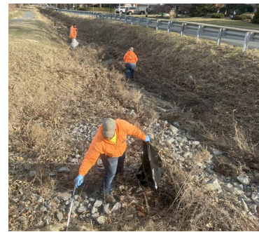
Borough crew cleaning up Broad Street Swale