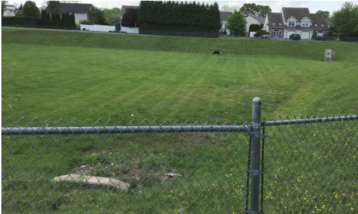
Detention Basin Hillpoint Circle

As you sit inside on a rainy day have you ever wondered where all the rain goes? It washes off the roof and down the gutters. It soaks into the yard, watering the yard and garden. It runs down the street and into those catch basin grates that we see on the sides of the road, then what happens to it? Here in Sinking Spring all that rain eventually ends up in the Cacoosing Creek. As it flows to the creek, it often carries with it all kinds of pollution, both things you can see and things you can't. All that pollution is both unsightly and harmful to the creek. Here in Sinking Spring we have an MS4 program to help protect the Cacoosing Creek from this pollution.